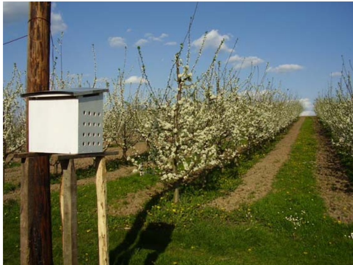
Figure 2. Wireless sensor station in the orchard

In addition to searching and analyzing data stored in the past, the web application has the ability to present current data in real time. The data last arriving from the field station are shown on the main page of the web application. Therefore, the user can monitor field conditions from any computer which has Internet access. The server side system can be upgraded with a web application customized for smart phones or with a module for sending SMS to users based on the set tasks.